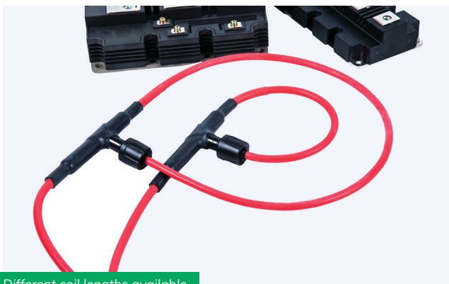
Different coil lengths available