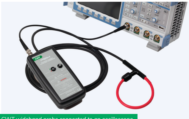
CWT wideband probe connected to an oscilloscope

The CWT and CWTHF combine an easy to use thin, flexible, clip-around Rogowski coil with an ability to accurately replicate fast switching current waveforms be they, sinusoidal, quasi-sinusoidal, PWM or pulsed.