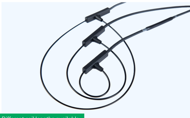
Different coil lengths available