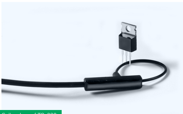
Coil on legs of TO-220

The CWT Ultra-mini (CWTUM) has an extremely thin, clip-around coil of typically 1.6mm cross section . With such a thin coil it is possible to access even the most difficult to reach parts of a power electronic converter with negligible disruption to the circuit under test.