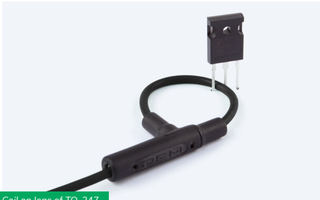
Coil on legs of TO-247

The CWTMini50HF offers a 50MHz (-3dB) bandwidth utilising a novel shielded clip-around coil of 100mm circumference and 3.5mm cross section diameter. The shield improves the performance of the current measurement in a circuit where the coil is exposed to fast dV/dt transients; e.g. when measuring rapid current transients in a semiconductor device with a high blocking voltage.