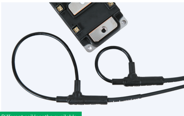
Different coil lengths available